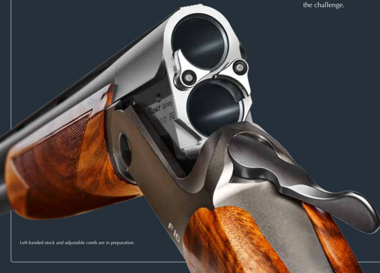
Left-handed stock and adjustable comb are in preparation.

The EBS® has another distinct advantage: shooter comfort is paramount so why would you want to force your gun closed to cock the ejectors? So relax shoot a Blaser and concentrate on what is really important, which is hitting the next target! Weather in the field or on the course the F16 is up to the challenge.